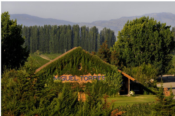
WE'LL VISIT MIGUEL TORRES CHILE, CURICÓ