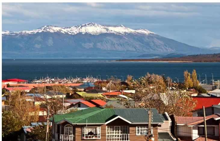
Puerto Natales was chosen among the 100 most sustainable destinations in the world