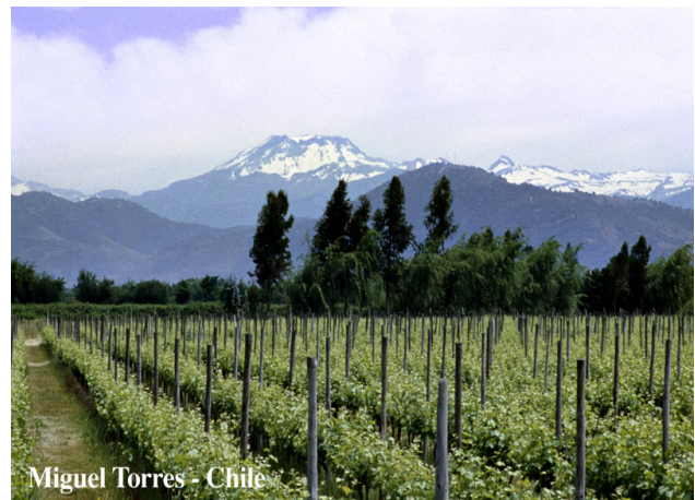
MIGUEL TORRES VINEYARDS HAVE SPECTACULAR LANDSCAPES