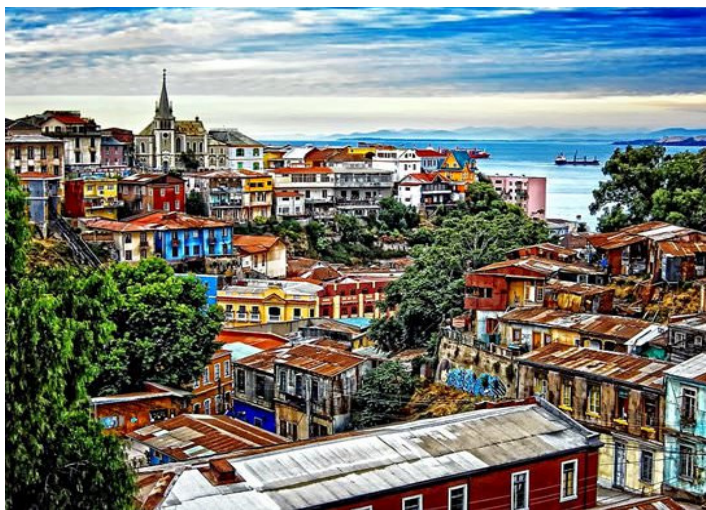
Valparaíso, Chile's historic city

Friday, April 7: Departure from the hotel and transport to the airport. Possibility of extending your stay at the hotel for those interested in visiting Santiago leisurely, on your own.